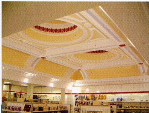
Replica Plaster Ceiling