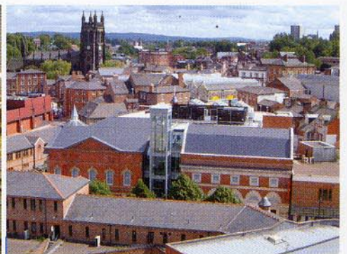
View across the town