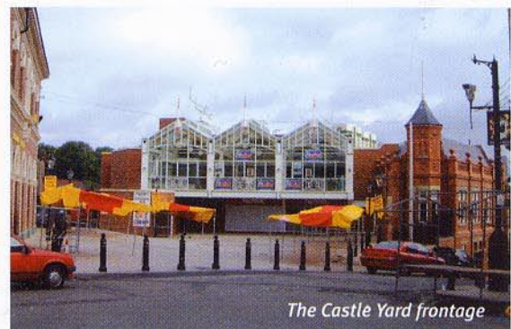
The Castle Yard frontage